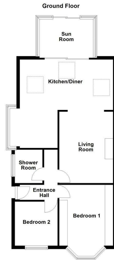
15 Highfield Mount, Dewsbury